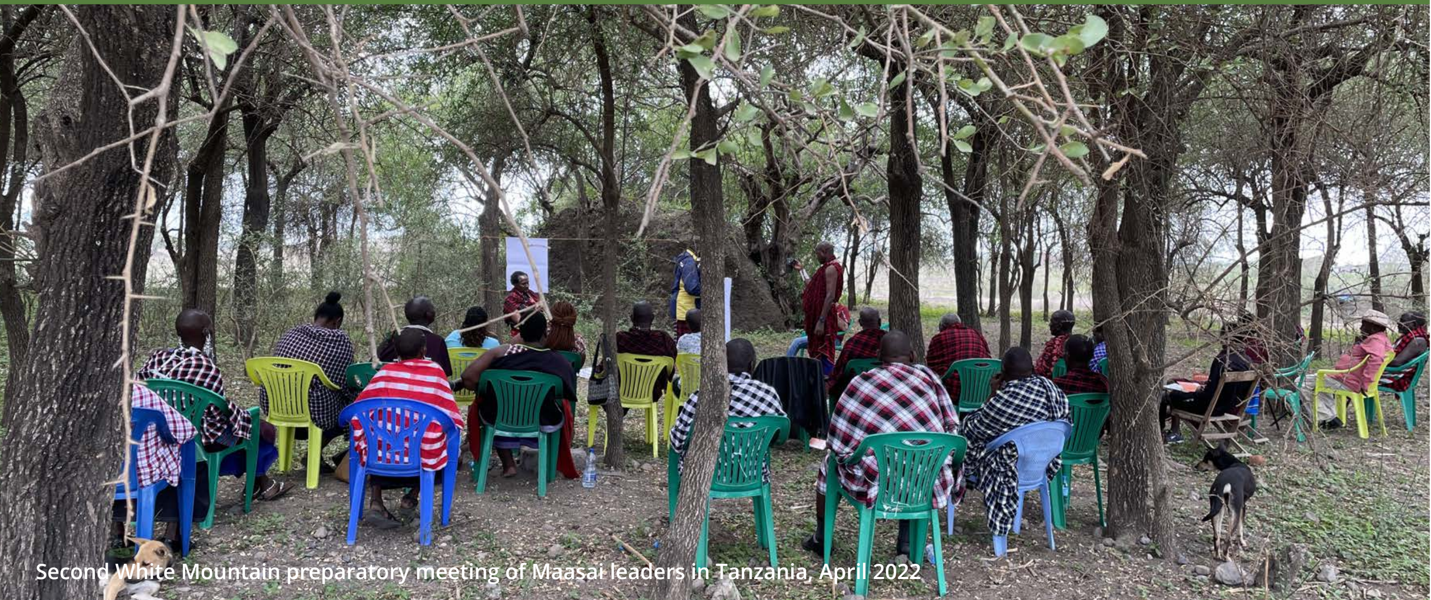
Second White Mountain preparatory meeting of Maasai leaders in Tanzania, April 2022

During a Large group gathering - Search Conference - in April 2019 in Kenya, Our Maasai leaders and others created the White Mountain vision for 2029 together with strategies and action plans for its realization. Thereafter, trainings took place in permaculture, holistic grazing management and social ecology. Other activities were also undertaken, including breeding more resilient cows, a tree nursery and tree planting, community food gardens and knowledge exchange. We are now making good progress to prepare for a Search Conference In Tanzania and organizing support from international NGO's and foundations for scaling up the implementation of our action plans and further growing our White Mountain community.